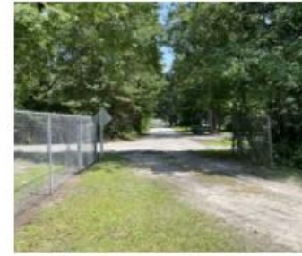
Community Center 9