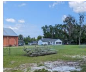
4 Play Equipment